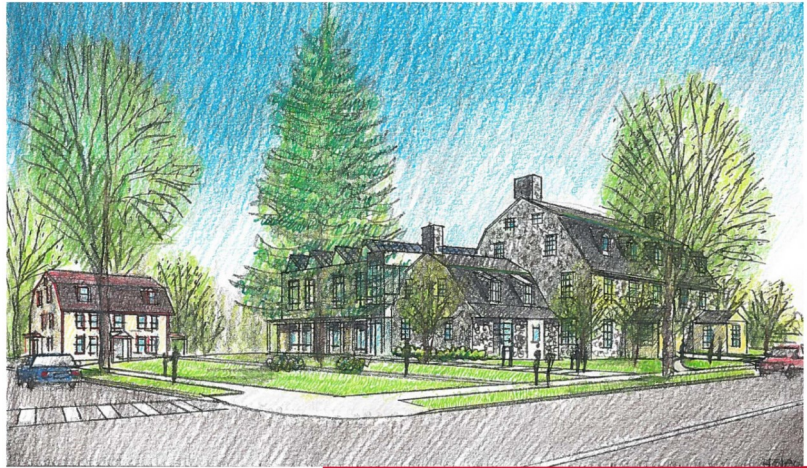
Proposed Front View